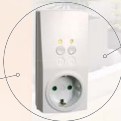
iJaz wireless power switch SP 16

SP 16 is a wireless switch which is controlled by the iJaz central control unit enabling lights and other electric apparatus to be switched on and off.