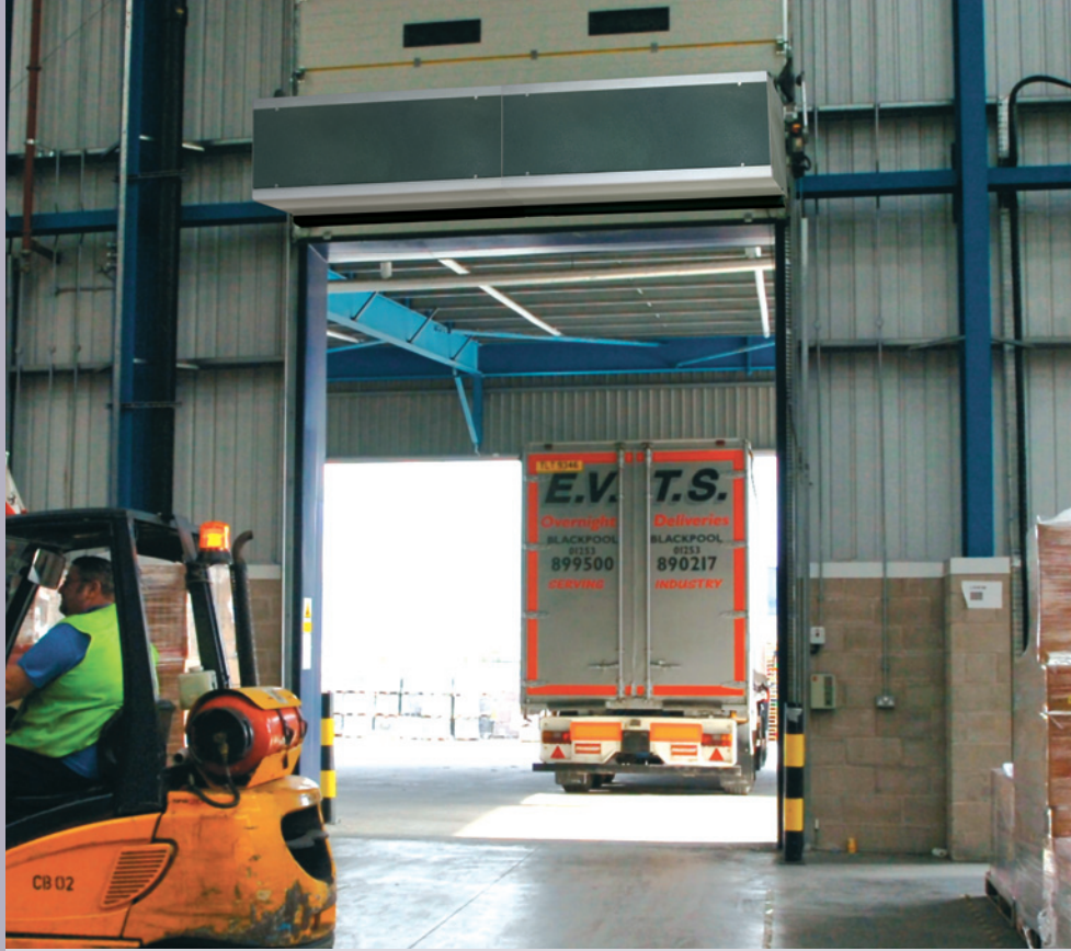
Model 2x IAB15W

Both 1m and 1.5m units are available in either LPHW, electric or ambient versions, and can be linked together as a complete air curtain system.