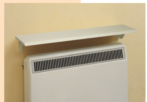
Storage heater with shelf