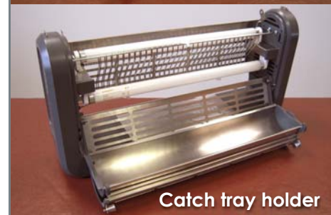
Catch tray holder