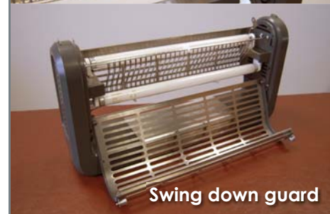
Swing down guard