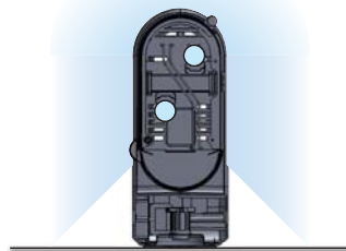
allure™ - Maximum light output