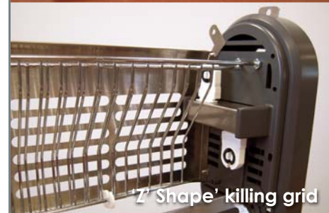
'Z Shape' killing grid