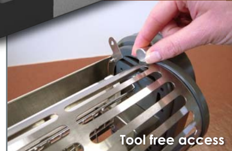
Tool free access