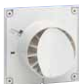
Backdraught prevention vanes fitted on discharge