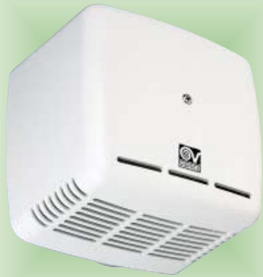
① Ducted installation. ② Wall or ceiling-mounted installation. ③ Model LL with motor with ball bearings: 30,000 h of guaranteed continuous operation.

Supply and install an Ariett centrifugal extract fan with integral backdraught shutter for installation in wall or ceiling and ducted applications as manufactured exclusively by Vortice only for Vortice. The fan should have a performance in excess of the requirements of the Building Regulations (Document F). The requirements are 15l/s for bathrooms/toilets/shower rooms and 6 l/s for toilets (model with a 15 minute overrun timer for internal rooms). It should be tested and certified as IPX4 (splashproof) with all performance data third party IMQ (BEAB recognised equivalent) verified. The fan should have a high impact ABS thermoplastic resin cover and be supplied with an anti vibration support gasket for tiled or uneven walls. The motor should be either a bronze bush or a stainless steel ball bearing, shielded pole motor (30,000-hour guarantee), and include a thermal cut out device. Control options should include: Speed control (using an optional controller), Timer and MHC (microprocessor humidity control).