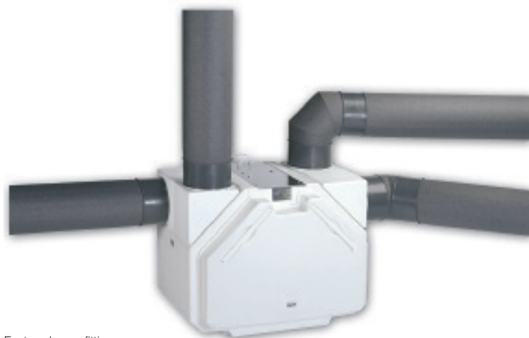
Fast and easy fitting

A range of matching cowed terminations is available.