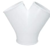
Y Piece Splitters 100 x 100 x 150mm Ref. 91282AA 125 x 125 x 150mm Ref. 91284AA 150 x 150 x 150mm Ref. 91285AA 150 x 150 x 200mm Ref. 91286AA